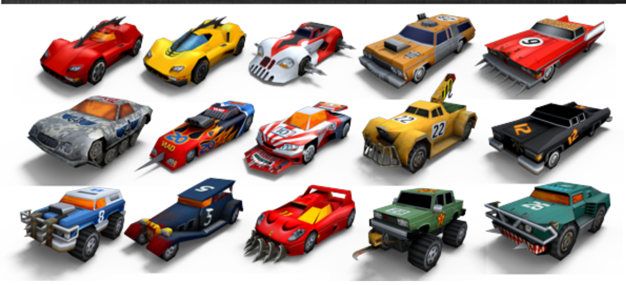
"Ladies and gentlemen, start your engines! Members of the public, you have ONE minute to reach minimum safe distance!"