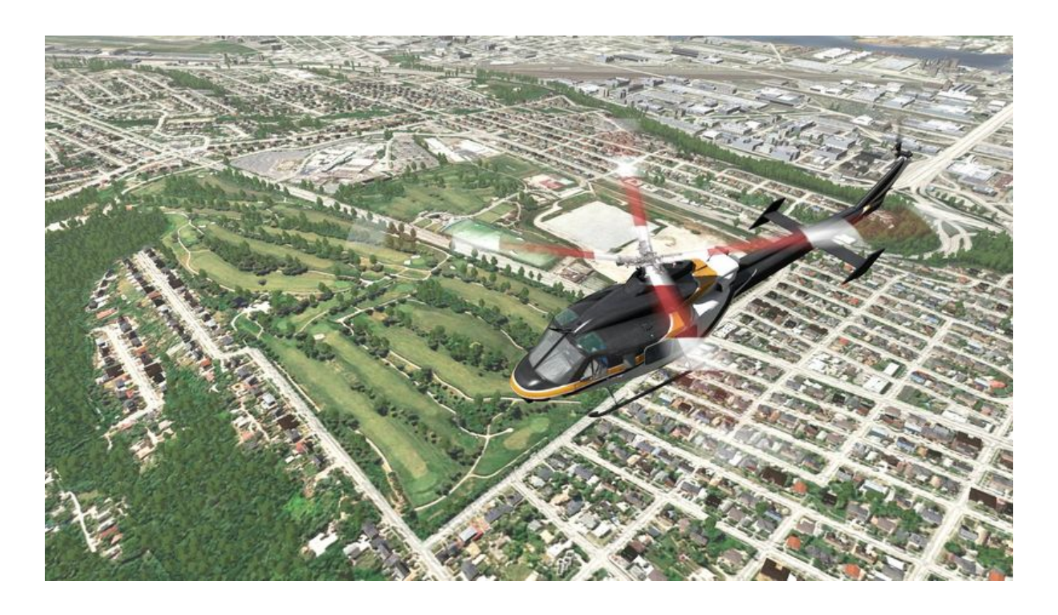
Take On Helicopters Download Ubuntu

Download ->>->> <a href="http://bit.lv/2NKronZ">http://bit.lv/2NKronZ</a>